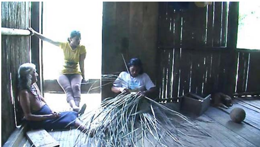
IMAGE 5 'baskets?', speaker B on the right initiates repair on A, in the center; B is occupied with weaving a basket and does not display or hold any relevant bodily behavior as A confirms: "yes".

((B is making a basket and does not look up))